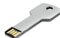
Fig. 1: Example of a flat USB-Stick.

Use only flat USB sticks (see Fig. 1), as other USB stick formats may not guarantee secure contact. This could affect the update or cause the device to not recognize the update file.